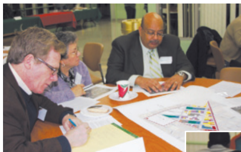
Over 100 local residents, business owners, religious institutions, elected officials and organizations participated at the Broadway Triangle Charette Visioning Workshop held on December 12, 2008 at Woodhull Hospital.

The event took place despite many obstacles and despite the city's unwillingness to be responsive to community input. This Charette finally gave voice to neighborhood residents who had the opportunity to express their thoughts and shape a new vision for the Broadway Triangle. The Broadway Triangle which sits at transportation nexus is the largest undeveloped zone in Brooklyn. That location offers the great opportunity to see new green develop that fits can we weaved into the fabric of the diverse neighborhoods surrounding the zone.